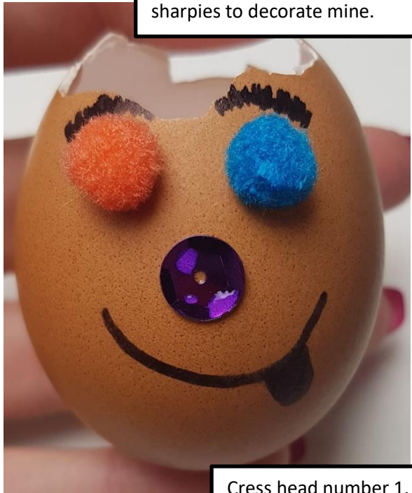
Cress head number 1.

Step 1- You will need an empty eggshell (or as many as you would like). Make sure the top of your eggshell has a big enough hole to fit cotton wool inside.