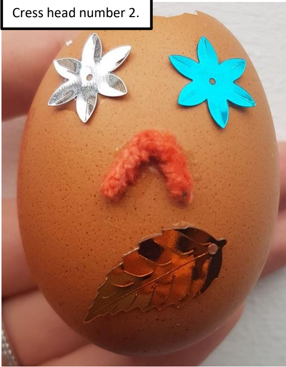
Cress head number 2.

Step 3- Grab an empty egg box that fits 6 eggs and cut the box so that you can only fit 4 eggs inside, like shown.